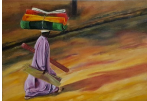
No title – N'Djamena, Chad € 439,-

My recent work is inspired by my travels to Chad (N'Djamena) and Mali (Bamako). I discovered many diverse cultures and expressiveness. I was pleasantly surprised by the positivity and the strong need that people have, to express themselves through art and music. I want to capture this emotion, in the moment and the movement. It reflects what is now and what is coming. Feel life, the beauty, warmth and sincerity, just for a moment.