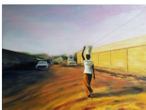
People in Motion – N'Djamena, Chad €449,-