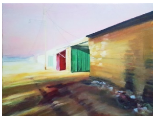
Wired Silence – N'Djamena, Chad €449,-