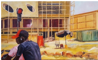
City Life – Bamako, Mali €549,-