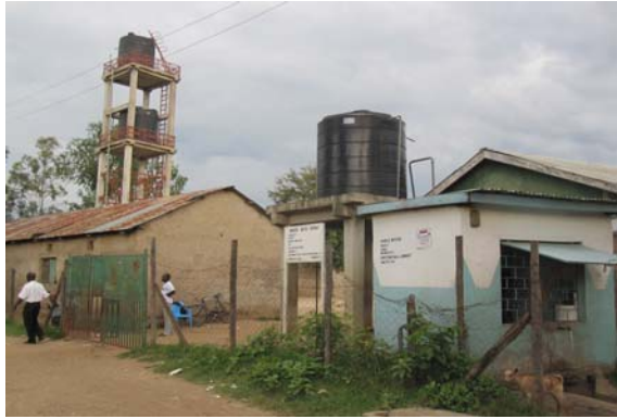
The pumping station annex water kiosk and the water tower

The implementation started in 2001, with SANA International as the implementing agency. The Ministry of Water and Irrigation, together with SANA, provided technical advice. The project was completed in 2006 and by then it constituted a borehole with a depth of 110 metres, a pumping station, a tower with two storage tanks of 10,000 litres each, a small office at the bottom of the tower, a pipeline system of about 5 km, seven water kiosks, and 60 private connections to homes.