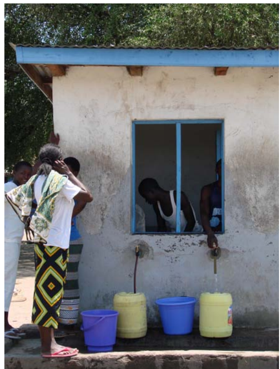
One of the water kiosks operated by the Company

In May 2011, connection costs as well as consumption costs for both individuals and institutions had to be raised. This was "inevitable" because of the increasing operational costs, such as wages, maintenance costs and especially costs for electricity. This meant for instance that the price of water for individual consumers from a water kiosk increased from the original one shilling per jerry can of 20 litres to two shillings. Yet, compared with 'normal' prices, this is still relatively low.