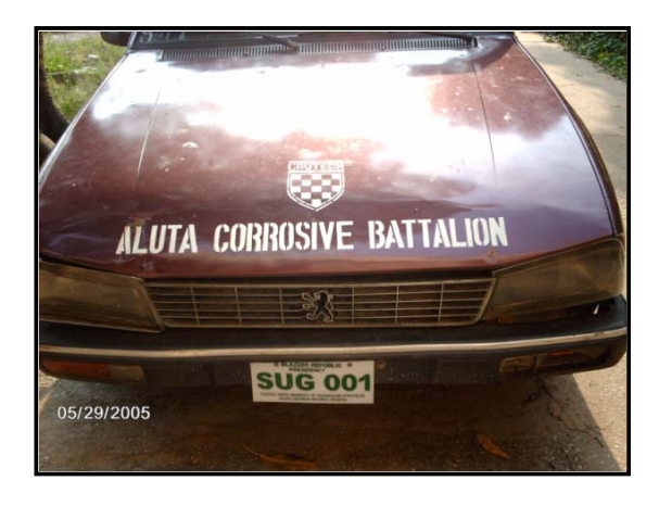
Plate 1: The official vehicle of the Student Union of Cross River University of Technology, Calabar. The "SUG" on the number plate is "Student Union Government".