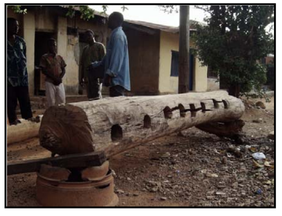
Plate 5 : The lie-detector. It is installed at several locations around Obudu. Each lie-detector centre is manned by appointed youths who report directly to the youth leader.

However, while the police are equipped with guns, shields, batons, teargas canisters, handcuffs etc, the main equipment employed by the Obudu Youth Movement is a device called liffung or lie detecting machine. This machine was fabricated by combining ideas gleaned from local and global media. On the one hand, the Obudu youths encountered liedetecting machines in detective films from Hollywood, where suspects are connected to equipment that determine when individuals tell lies. On another hand, the youths saw images of slave holding devices in some Nigerian video films<sup>12</sup> that they saw. From this eclectic hybrid of local and global images the Obudu youths then created the lie-detector. The youths employ this new device in social spaces, times and contexts different from the sources of the original ideas. This machine neither requires electricity nor the power of charms to operate. The lie-detector is, simply, an effective torture equipment – a long heavy wood with holes through which suspects are logged on (plates 5 & 6). The methodology of the lie-detector is to generate pain, excruciatingly beyond the bearable thresholds of the human nerves. For most individuals 2 minutes on the lie-detector is more than sufficient. In Obudu, it is believed that "no one can go into that machine without telling the truth".