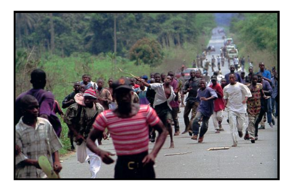
Plate 4 : In the break down of law and order, angry youths other than militias also enact their own contestations.