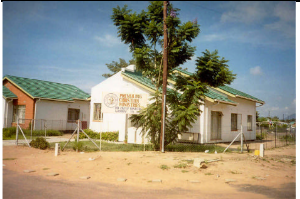
Mission house of the Ghanaian Pentecostal Prevailing Christian Ministries in Gaborone

their lives or any ritual that needs to be performed. The Batswana live their own lives and the Ghanaian theirs, and whereas the Ghanaian Pentecostal leaders claim to be open to any call from their Batswana members for whatever situation or ritual, in reality this hardly ever happens. Particularly the small branch of the Ghanaian Church of Pentecost made a very secluded impression and in every respect confirmed Church of Pentecost ritual practices as can be witnessed in Ghana.