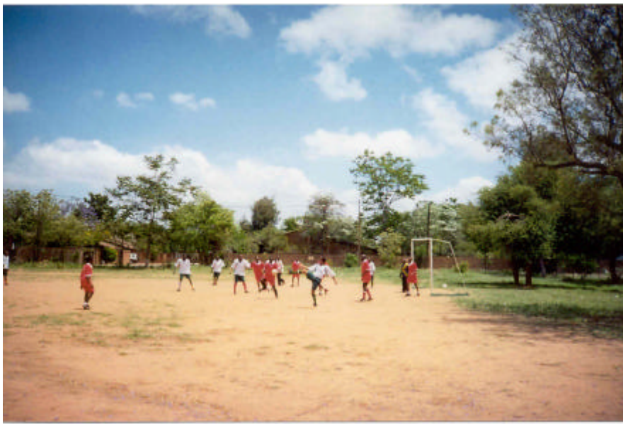
The Malawi social soccer-team (in white & green)

less secretive visit is paid to one of the powerful healers in Malawi. The ones in Gaborone are declared to be ‘charlatans’ as they do no longer represent the pure form of Malawian healing.