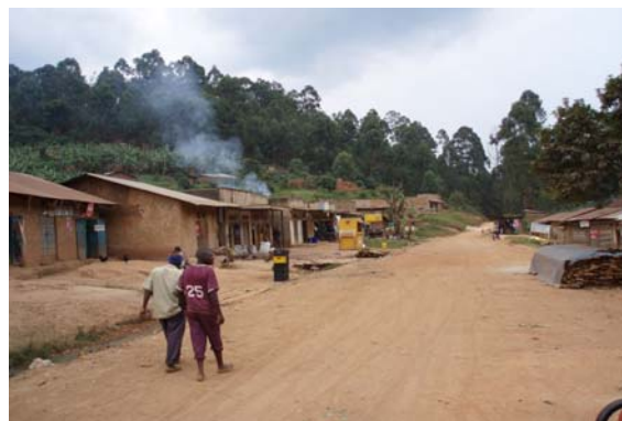
Town around Kisiizi

The study focused on the direct and indirect effects of Microcare's health-insurance scheme (i.e. its effect on medical expenditures and strategies to finance these expenditures), and found a positive association between the scheme and these indicators. Three practical recommendations can be offered as a result of this study. The limited availability of cash in households, especially in rural areas, may trigger informal loans and asset sales to finance the payment of premiums, transport costs or co-payments for consultations and treatment. To minimize informal loans and asset sales, it is therefore recommended that (1) micro-insurance schemes are restricted in charging co-payments beyond the level required to prevent moral hazard, (2) design tailor-made premium payment schedules that coincide with households' cash availability and (3) operate in conjunction with a micro-finance institution to facilitate the payment of premiums and/or encourage savings to cover future payments. The precise possibilities to implement these recommendations should be assessed in the context of the scheme(s) under consideration.