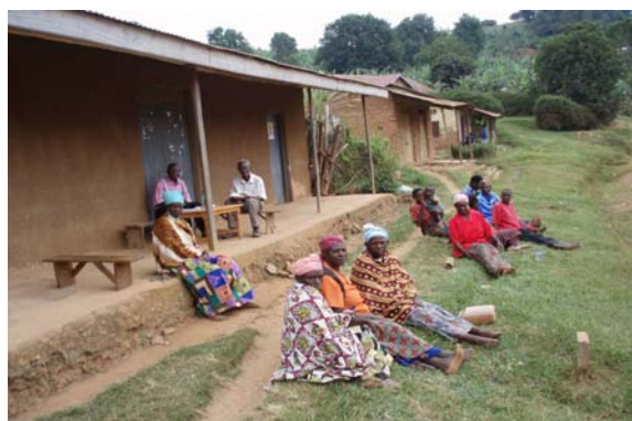
Microcare meeting in Kamoobwa

Although insured households use other strategies less often to finance medical expenditures, there are two reasons why health insurance is unlikely to make these other strategies completely redundant. First, Microcare's insurance policy covers a limited number of costs and excludes, for example, medication for chronic illnesses that may confront insured households with high recurring costs. This can