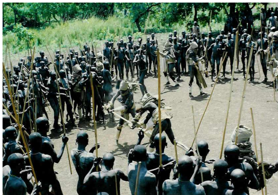
Suri ceremonial stick duelling

Numbering about 35,000, the Suri live in an area of southwest Ethiopia close to Sudan that has traditionally been marginal to the Ethiopian state. However, this group of agro-pastoralists has moved from obscurity to major 'stardom' over the last fifteen years. In the international discourse on tourism, the Suri have been cast as the new 'noble savages' and the region has become a popular destination for rich explorer-tourists seeking a picturesque, original and primitive African people in a non-industrial, natural setting. A host of photo books, websites, travel magazine articles and film documentaries have created a famous people who are now receiving a substantial income from their visitors. Suri ceremonial duelling, armed youngsters, women with lip-plates, male body decorations and the austere portraits of individuals all present irresistible photo opportunities for tourists and professional film-makers alike.