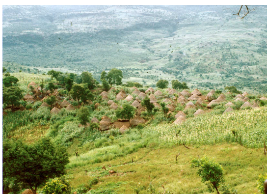
A village in the Suri region of Ethiopia in the dry and wet seasons

In addition to a fascinating case-study revealing a lot about people's social adaptation in times of crisis, both individually and at a household level, this research project yielded interesting comparative insights into social, psychological and cultural responses to the challenges of growing violence, the interaction of culture and local politics, and the fate of smaller ethnic groups caught up in processes of state pressure, globalization and environmental change.