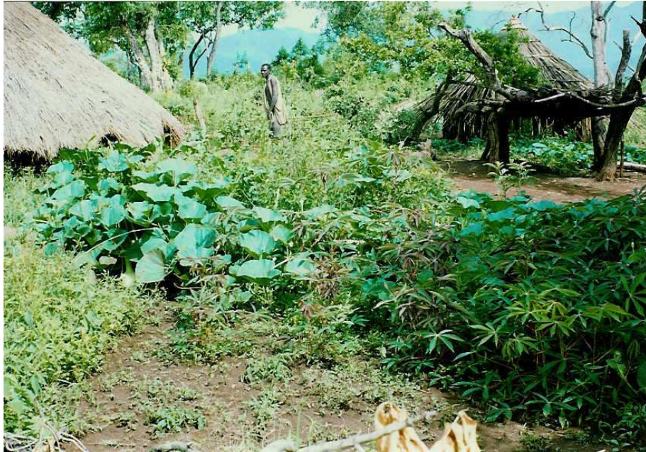
A typical village garden, tended by married women