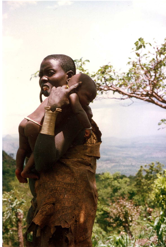
Suri mother and child