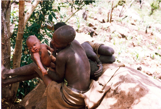
A Suri mother resting with her newborn baby during work in the fields

In a comparative perspective, these findings may not seem totally new but show in detail the local intricacies of conflict and the deep-rooted nature of patterns of regional insecurity in the Ethio-Sudan border area that policies by state authorities and NGOs cannot easily alter, and indeed sometimes even aggravate. They also highlight the remarkably rapid process of change in small-scale societies. This is illustrated, for instance, by a quick Internet search that demonstrates the Suri's