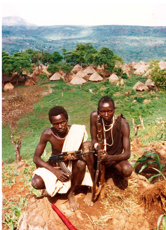
Two armed Suri youngsters