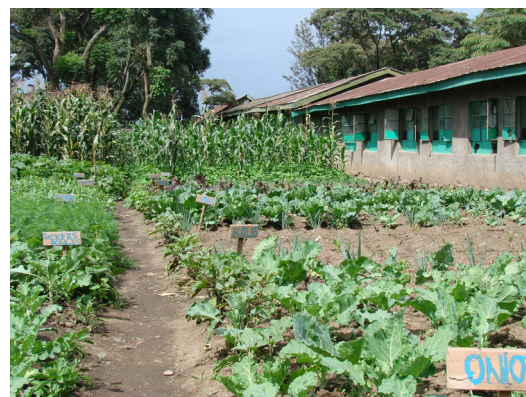
The well-tended shamba of a public primary school in Nakuru participating in the Gardens for Life project

• Sufficient land. 'Not enough land' was by far the most frequently mentioned answer to the question about why non-crop-cultivating schools did not grow crops, while almost half of the schools that did cultivate crops saw their 'lack of enough land' as a serious constraint. Yet, even though the compounds of some schools in Nakuru were indeed (too) small for a crop garden, the data suggested that for most schools the availability of land did not have to be a major constraint to start or expand crop cultivation. The example of Nyandarua Boarding Primary School in Nyahururu (participating in the Gardens for Life project) shows that even a plot as small as one acre can be very rewarding in terms of yield, feeding capacity and (saving) money.