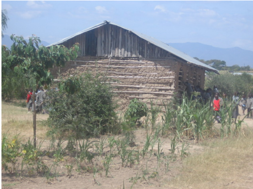
Crops suffering from drought in the shamba of a public primary school in a low-income area of Nakuru

As for livestock keeping, it was more common among secondary than primary schools. Cattle were the most commonly kept animals (in 11 schools). Milk was their most important product. In all cases, some of the milk was used for the teachers' tea and some was sold. In nine schools, the milk was also used for the pupils' feeding programme.